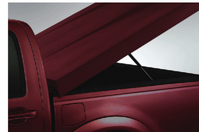
Able to lift up to 60cm