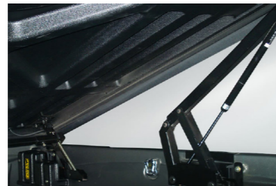
100% Waterproof Rubber Sealing