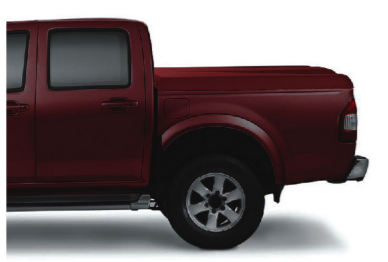
Made from Engineered polymer