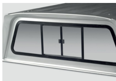
Rear sliding window

✓ Aeroklas warranty covers three years for the inner and outer shell and twelve months for components