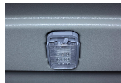
Interior Dome Light