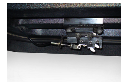
Latches to locking plate