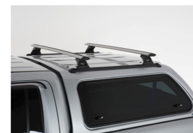
Track Mount Canopy Roof Bars