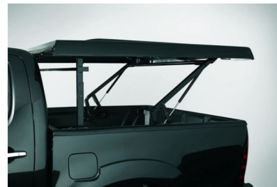
Roof Height Lift Up

✓ fuel economy Available with 2 textures: black leather grain and factory painted OE quality paint