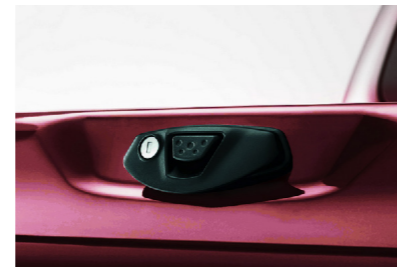
Strong and Secure lock