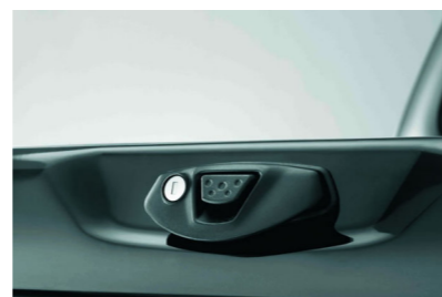
Strong Key Lock