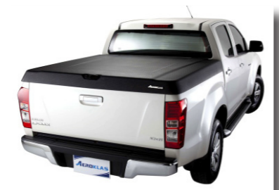
ABS Grain Finish