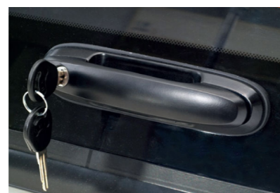
Rear Lockable Handle