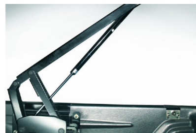
Strong & Secure Lock System