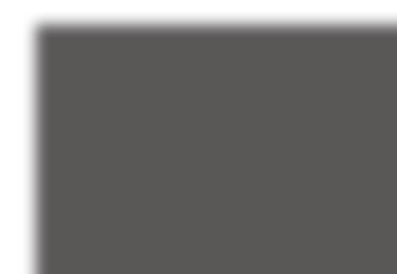
Gas strut supported