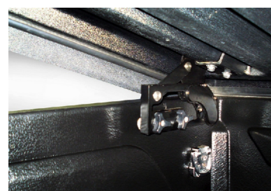
Robust and Durable