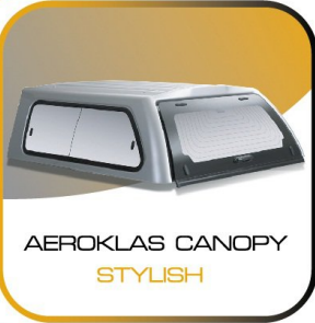
AEROKLAS CANOPY STYLISH

The first brand in the world who reinforces “ABS Double Shells” for double strength.