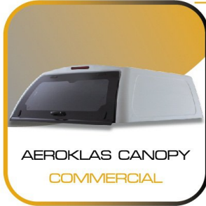
AEROKLAS CANOPY COMMERCIAL