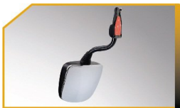
Rear view mirror.