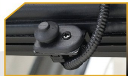
LED Door light.