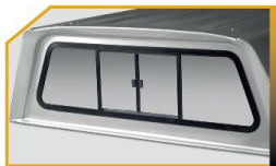
Slide front window.