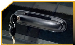
Handle lock and keys.