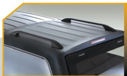
SUV Roof Rail