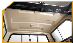
ABS Inner Shell.