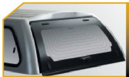
Rear window with defroster.