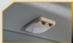
Door light limit switch.