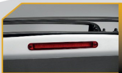
LED Brake light, built-in and fixed permanently into the roof.